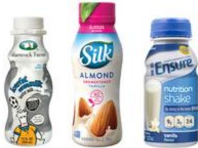
milk + non-dairy