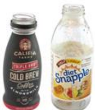
coffee + tea