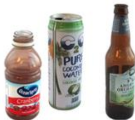
juice + hard cider