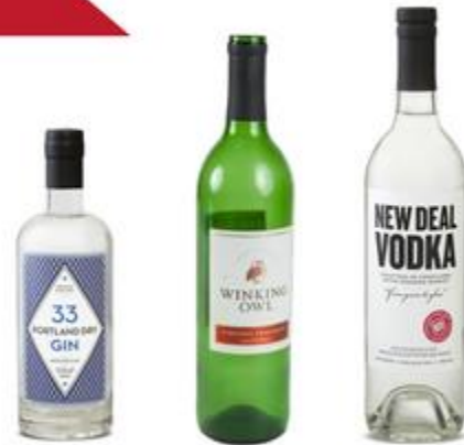
wine + spirits